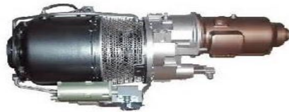
Auxiliary Power Unit outside the aircraft