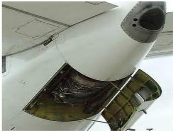
Auxiliary Power Unit inside the aircraft